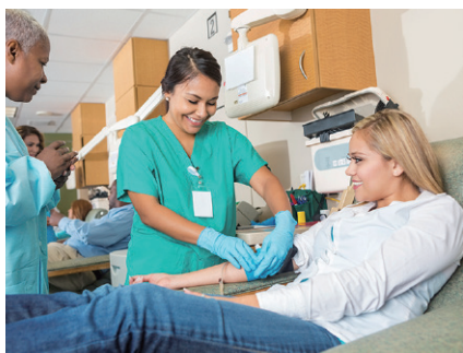
Hospital Collection blood center