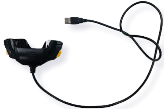
Snap on charger