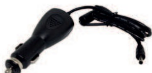
Cigar cable charger AT-CASPA4308