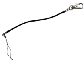
Stylus attachment AT-CAE806