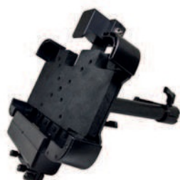
vehicle dock AT-CAE1011B