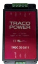
DC Converter AT-CAE1005