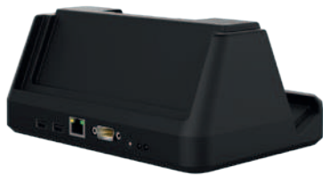
Desktop Dock AT-CAE1201