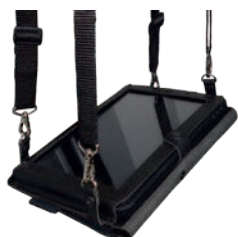
Harness Carrying Case AT-CAE1013