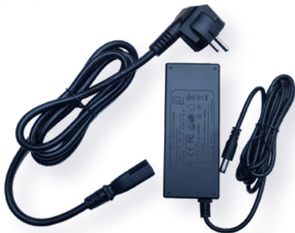
Power supply AC 100V-240V, output 12V/4A adapter AT-CAEPC01

The EPC15/EPC15A box include the EPC15 Panel PC, a power cable and its power supply, a wifi antenna and fixing grips.