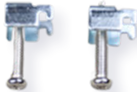
Standard PPC_hook assembly AT-CAEPC02